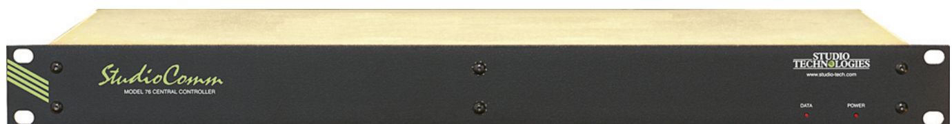
Model 76 Central Controller Front Panel