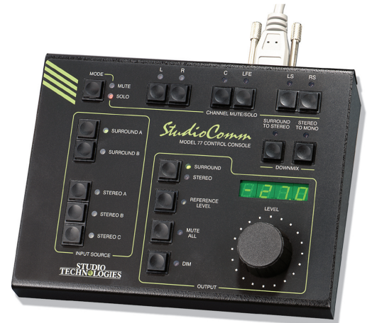
Model 77 Control Console

The Model 77 Control Console is the "command center" that is designed to reside at an operator's location. It allows fingertip selection of all monitoring functions. Numerous LED indicators provide complete status information. A 4-digit numeric display indicates the monitor output level in real time. While most installations will use only one Model 77 Control Console, up to four can be connected to a Model 76 Central Controller. This provides multiple users with full control over the monitoring system. Each Model 77 connects to a Model 76 Central Controller using a 9-pin cable. A major strength of the Model 77 is its ability to configure, under software control, many important operating parameters.