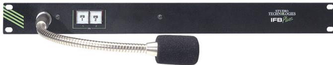
Model 22 Access Station (shown with optional Model 25A Rack Adapter and Model 11A Gooseneck Microphone)

Several mounting options are available. One adapter allows the Model 22 to be mounted in a single rack space. A second adapter is used to install the Model 22 in a table or console opening.