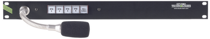
Model 24 Access Station (shown with optional Model 27A Rack Adapter and Model 11A Gooseneck Microphone)

can be connected. Up to four Model 24 units can be connected and supported by two Model 2 units. The Model 27A 19-Inch Rack Adapter allows a Model 24 and a Model 11A Gooseneck Microphone to be mounted in a single space of a standard rack enclosure.