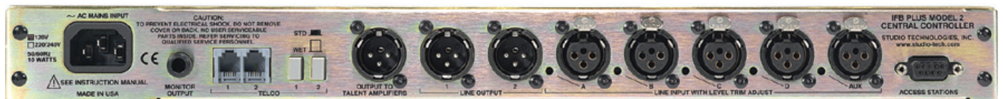
Model 2 Central Controller Back Panel