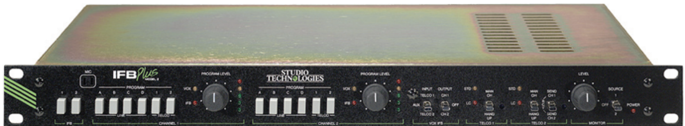
Model 2 Central Controller Front Panel

Studio Technologies has addressed these requirements with the IFB Plus Series products. The IFB Plus Series consists of the Model 2 Central Controller, the Model 22 and model 24 Access Stations, the Model 32A and Model 33A Talent Amplifiers, and supporting accessories. These products combine the best features of studio IFB systems along with the special requirements of mobile applications. The end result is an IFB system that is flexible, versatile, and extremely space efficient.