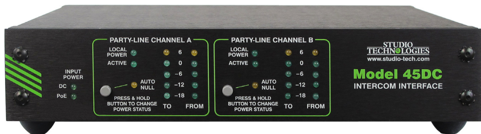
Figure 1. Model 45DC standard “throw-down” front view

A Model 45DC can interconnect with devices such as matrix intercom systems, DSP processors, and audio consoles. The Model 45DC is directly compatible with the RTS ADAM® OMNEO® matrix intercom network. Alternately, two Model 45DC units can interconnect by way of the associated Ethernet network. The Model 45DC can be powered by Power-over-Ethernet (PoE) or an external source of 12 volts DC. Two party-line power sources with impedance termination networks can be supplied by the Model 45DC, allowing connection of two sets of user belt-packs such as the Clear-Com RS-501 and RS-701. A Model 45DC